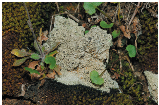
Fig. 3. Diploschistes muscorum – a hyperaccumulator of zinc and lead

Ryc. 1. Cladonia pyxidata – częsty porost naziemny w obszarach galmanowych