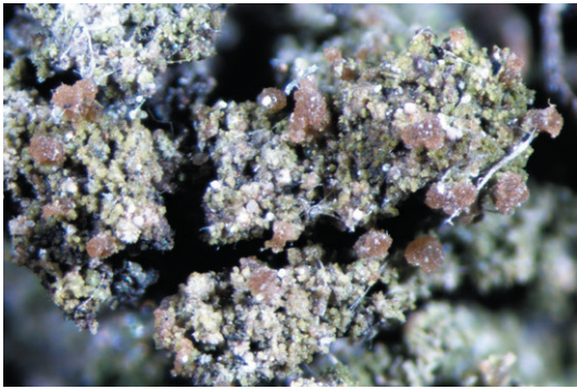
Fig. 4. Vezdaea leprosa – a common microlichen in post-mining areas

Ryc. 4. Vezdaea leprosa – częsty mikroporost w terenach pogórnicych