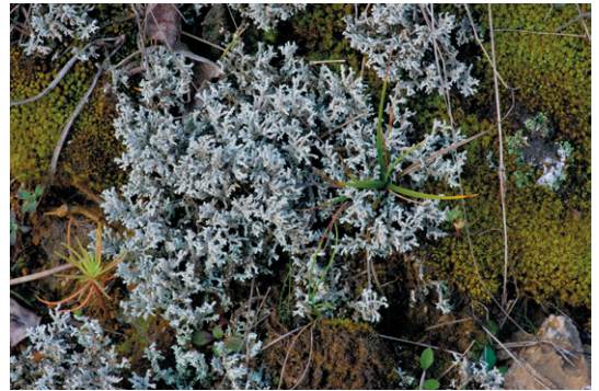
Fig. 5. Stereocaulon incrustatum – a fruticose lichen of the OOR

conista , Verrucaria xyloxena , the lichenicolous fungus Cladoniicola staurospora ), taxa under legal protection in Poland ( Caloplaca cerina var. muscorum , Cetraria aculeata , C. islandica , Cladonia mitis , Peltigera didactyla , P. rufescens , Pseudevernia furfuracea , Stereocaulon incrus-