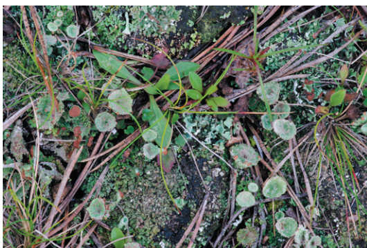
Fig. 1. Cladonia pyxidata – a common terricolous lichen in calamine areas

Ryc. 1. Cladonia pyxidata – częsty porost naziemny w obszarach galmanowych