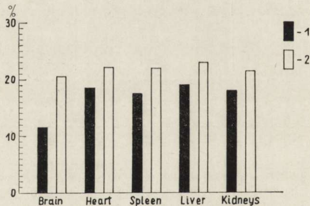
Fig. 2. Dry residue in per cent of fresh mass after fixing in alcohol (1) and formalin (2).

Organs of M. musculus fixed in 90% alcohol and 4% formalin were dried, and the dry residue expressed in percentages of the fresh mass. As can be seen from Fig. 2 the dry residue of organs fixed in formalin