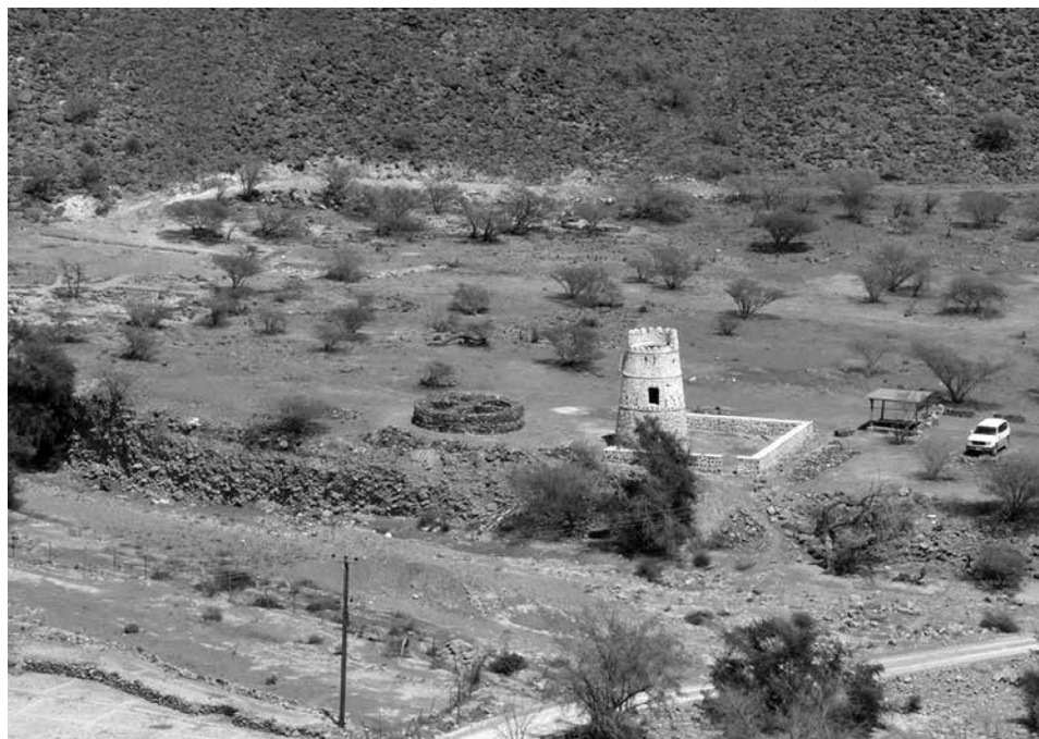
Fig. 3. View of the Bronze Age copper-smelting site HLO-1 located on a terrace of Wādī al-Hilo (Sharjah, UAE)