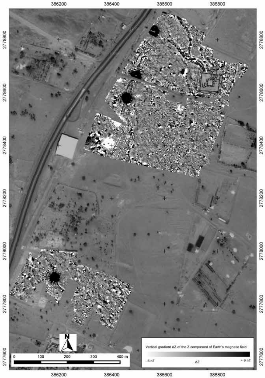
Fig. 2. Result of the magnetic survey in Mleiha (Sharjah, UAE) with 10-probe Fluxgate gradiometer array LEA MAX, total investigated area: 27 ha