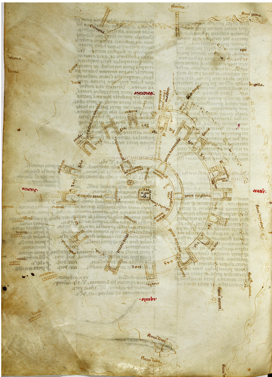
Ill. 2. The 'map' of Milan, Cronica extravagans of Galvano Fiamma, Milan, Biblioteca Ambrosiana A 275, fol. 46v