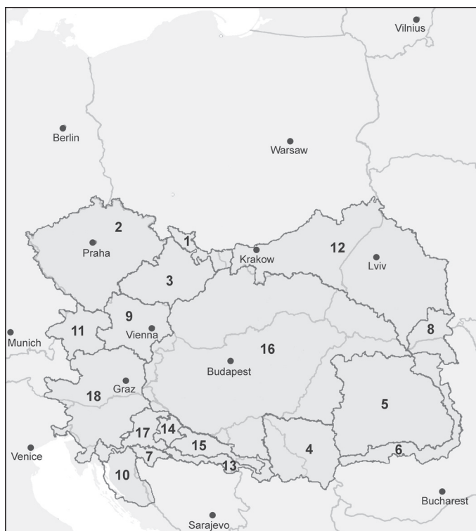
Figure 1. The extent of the First Military Survey in the Middle Europe including Galicia territory. Dark grey lines indicate Habsburg Empire borders, light grey lines indicate present-day international borders. Regions and periods of survey: 1 – Silesia 1763, 2 – Bohemia 1764-1767, 3 – Moravia 1764-1768, 4 – Banat 1769-1772, 5 – Transylvania 1769-1773, 6 – Vlach-Banatian Regiment 1773-1774, 7 – Bani Regiment 1773-1775, 8 – Bukovina 1773-1775, 9 – Lower Austria 1773-1781, 10 – Karlovac District 1774 – 1775, 11– Upper Austria 1775-1777, 12 – Galicia and Lodomeria 1779-1783, 13 – Slavonian Military Frontier 1780, 14 – Varsadi District 1781-1782, 15 – Slavonia 1781-1783, 16 – Kingdom of Hungary 1782-1785, 17 – Croatia 1783-1784, 18 – Middle Austria 1784-1787