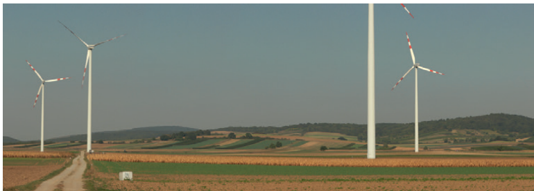
Figure 10. Agricultural landscape with wind turbines