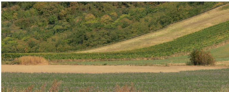
Figure 7. Vineyard landscape - partially afforested

in the Slovak part of the study area (Fig. 5). By using photomontages selected vineyards were replaced by areas typical for the initial stage of the natural succession, hereinafter rising 5 succession (Fig. 6). Again it was assumed that such change affects the aesthetic quality of landscape while the rate of such