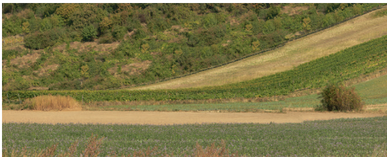
Figure 6. Vineyard landscape - partially changed by self-sowing