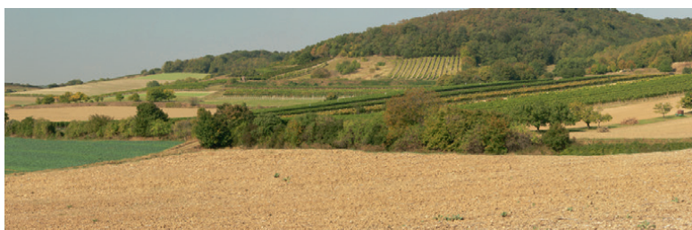
Figure 3. Landscape consisting of large blocks (ploughed variant)