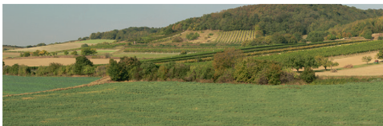
Figure 4. Landscape consisting of large blocks (green variant)