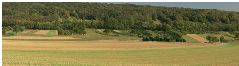
Figure 9. Agricultural landscape without any buildings