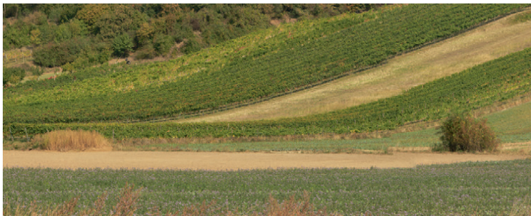
Figure 5. Vineyard landscape