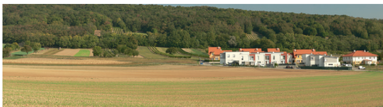
Figure 8. Agricultural landscape with new suburban houses

years ago, wind turbines were not important but now they have a major impact on many scenes” (Bell 2004: viii). The effect of wind turbines on the aesthetic quality of landscape has received a considerable amount of attention while the approaches differ depending on applied methods and types of respondents (for more details see for example Molnarova et al. 2012). Similar works involved with the subject (e.g. Lothian 2008; Zoellner et al. 2008; Cetkovský & Nováková 2009; Frantál & Kučera 2009) confirm the opinion that the perception of wind turbines in landscape always depends on a number of factors and a local approach must be applied when investigating the perception of these structures. In this study the effect of wind turbines in irregular arrangement was studied. Bell (2004) used a wind turbine as an example of a vertical line form in space. Lines can cause visual forces and tension depending on how they are positioned. A single object (a wind turbine) can be easily be positioned in the landscape. But a larger number of wind turbines are more difficult to accommodate, as they must relate to both landscape and to each other (Bell 2004).