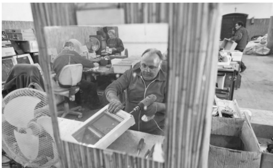
Fig. 5. Disadvantaged people working for the dismantling plant

In the plant office devices, consumer electronics, household devices, industrial and all kinds of electronic waste are processed. The company's annual capacity is 600 tons, storage sites are in Budapest and Tarnabod, but they also collect e-waste personally from partners, free of charge if necessary. Storage, transport and processing capacity meets the requirements of the market. For demolition works they act as a private agent on the market and contact private companies, offices and public institutions for collecting the waste. Every 20 tons of e-waste allows the employment of somebody and the creation of a new job. The e-waste dismantling plant in Tarnabod provides 30 full-time jobs for needy and disadvantaged people (Fig. 5).