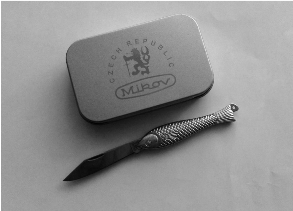
Fig. 2. Fishlet, a traditional folding pocket knife produced by Mikov

The continuation of traditional production is a priority for the company, which is declared and promoted. The foundation of the Museum of Cutlery Production in the quarters of Mikov is an example. The company feels "at home" in the Šluknov region precisely for the tradition. Fishlet, a traditional folding pocket knife produced by Mikov (Fig. 2), has acquired regional product of Czech-Saxon Switzerland certification ( www.regionalni-znacky.cz/ceskosaske-svycarsko ).