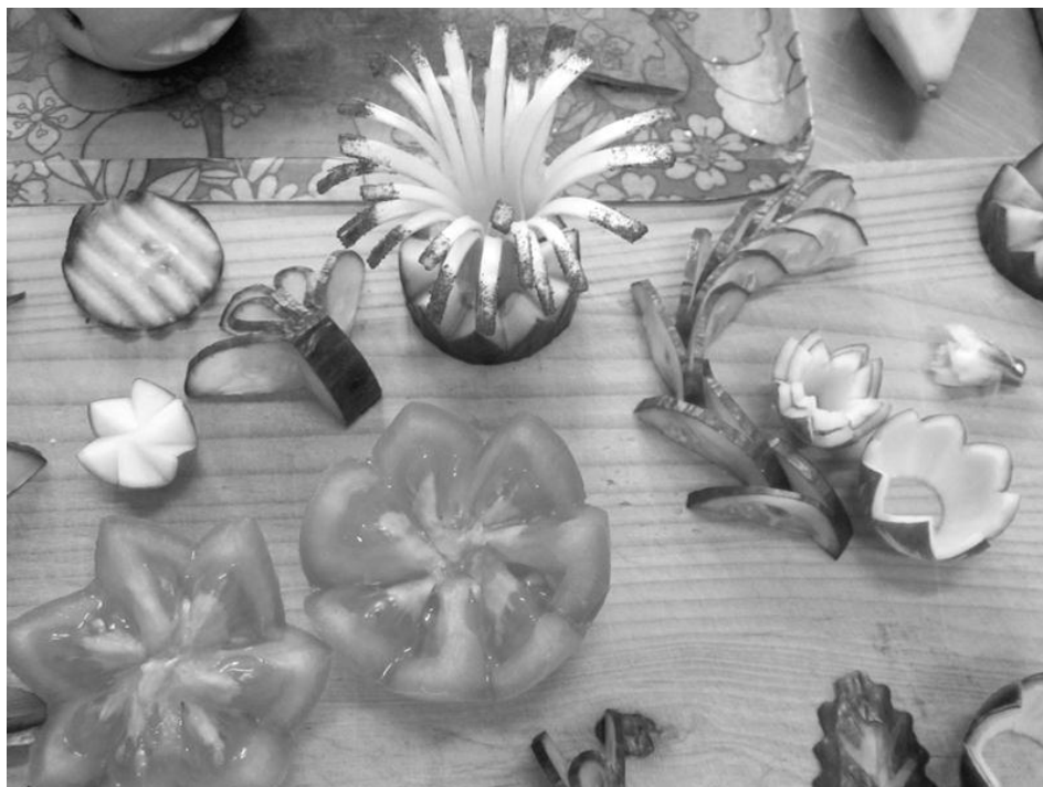
Fig. 7. Cooperative's catering products

The creation of a social cooperative model by the public authority and an NGO, in order to save jobs and even create new ones in the rural periphery, where people with such skills would probably become unemployed, is probably the most important strength of this practice. Those people are thankful for retaining their job, which reflects in their performance. The product (catering of traditional food – Fig. 7) is a benefit to all consumers and local people are more interested in supporting the work of the cooperative by buying their products or organizing events using the cooperative's catering services. Unfortunately, the low prices of services can sometimes have a negative foretoken: some potential clients see the catering prices as an indicator of quality. Other potential clients will dislike the type and the name of the organization from which they could buy services, since "social cooperation" reminds them of a non-professional service and low quality products.