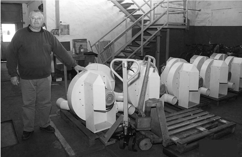
Fig. 4. General manager of the company with ventilation products