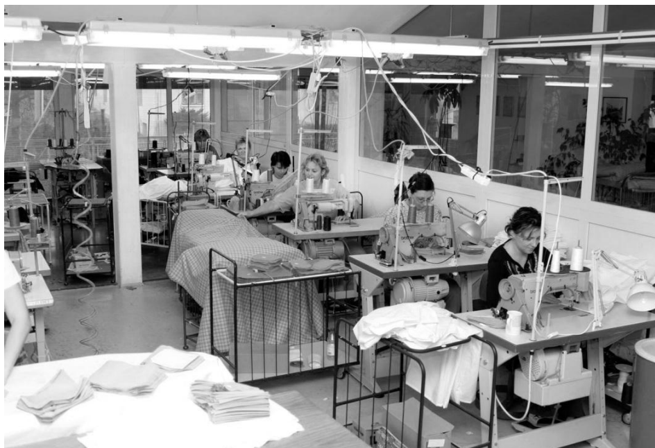
Fig. 8. Production of medical clothing in the premises of the Janoli company

Janoli products are primarily intended for the Slovak market, but the Czech market is also very important. In the past, the second largest share of production was directed to the Netherlands, which currently ranks third. Since the beginning of production the majority of medical and rescue workers garments were produced for a Dutch company that later moved production to Tunisia so Janoli lost this customer.