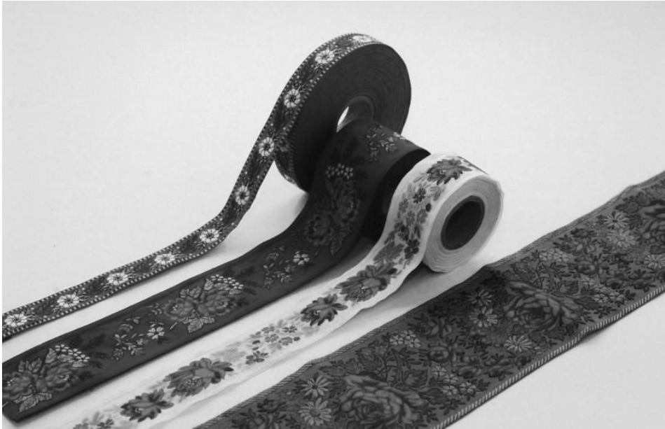
Fig. 3. Folk costume and decorative ribbons produced by Stap

is exported to the European Union. Further partners are the USA, South-American countries, Japan and Russia.