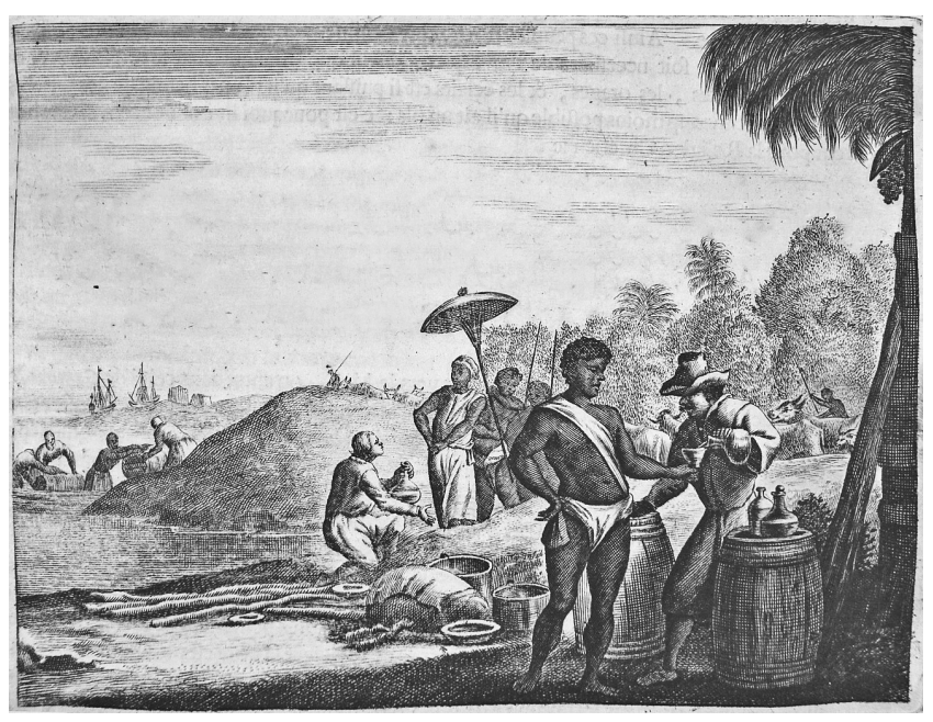
1. Olfert Dapper, The trade between the Europeans and the Africans on the shore of West Africa

Behind the first scene a European merchant with his head uncovered kneels before the local ruler, most probably that of one of the states of the Wolof people. The merchant is holding a bottle in one hand and is making a gesture of greeting and honour with the other. Most probably he is also offering a drink as a gift to begin trade negotiations. The ruler is recognisable by the attire covering his entire body,<sup>25</sup> as well as by the parasol held above his head by his suite made up of two persons. The latter are only wearing sashes on their hips but are armed with spears.