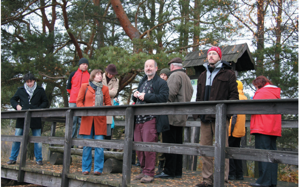
Figure 3. Participants of the Warsaw Regional Forum 2009 during a field studies trip in the Biebrzański National Park.