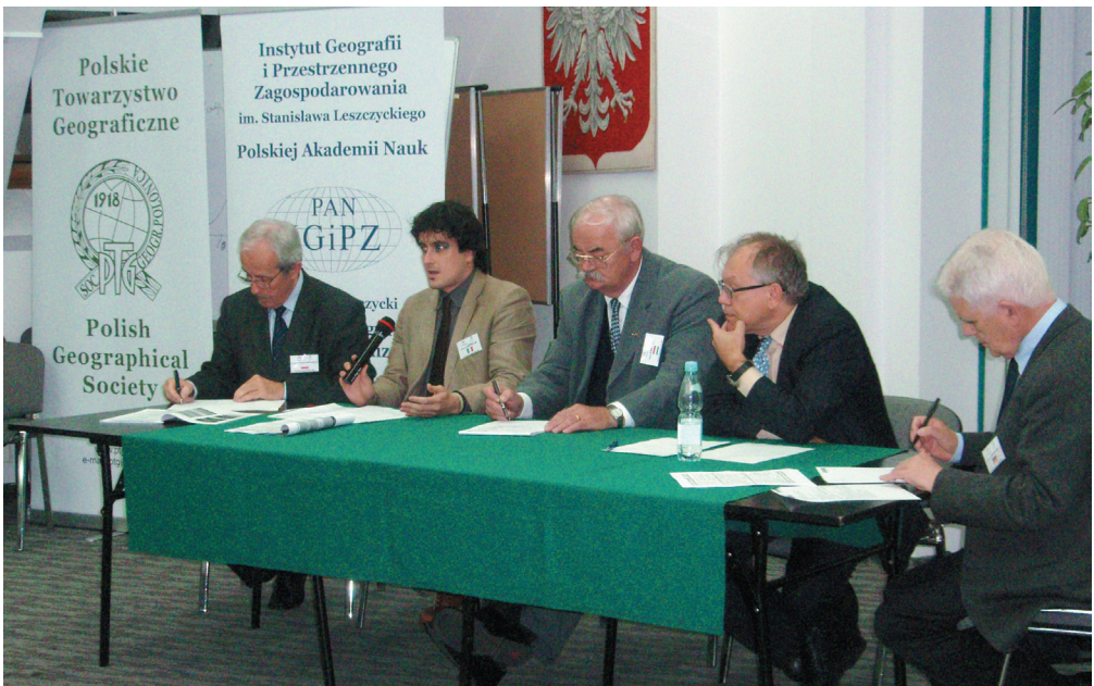
Figure 4. Participants of the Warsaw Regional Forum 2009 taking part in a Discussion Panel Networking in European, regional and local space .