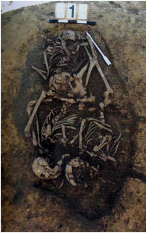
Fig. 1. Milejowice, Wrocław District, Silesia; grave associated with the Únětice culture (classic phase) contained the remains of four individuals (3 adults and an infant); (Pokutta 2013, after Kopiasz 2007, 53)