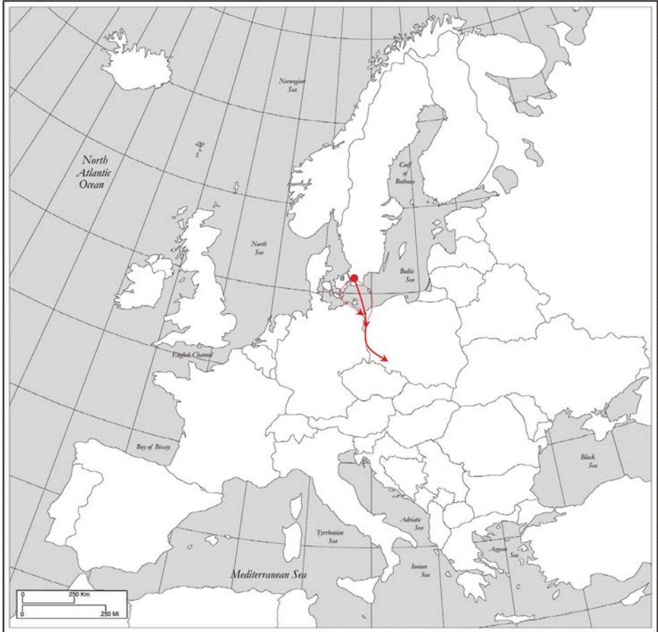
Fig. 5. Long distance immigrants in Early Bronze Age Silesia — male from Milejowice, Wrocław District. The distance between the assumptive place of his origin (Scania, SW Sweden) and Wrocław was approx. 870 km. Dotted line indicated another potential sea route: southern coast of Sweden to Bornholm, and from Bornholm to northern coasts of modern Poland (vicinity of Szczecin)