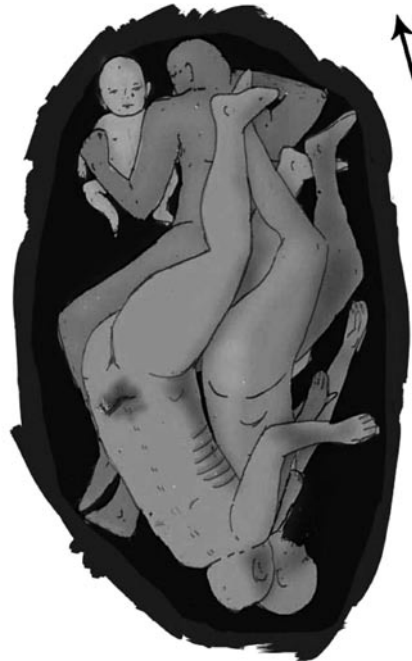
Fig. 2. Milejowice, Wrocław District, Silesia; body position of the deceased in the grave reconstruction (graphic by R. Potter)