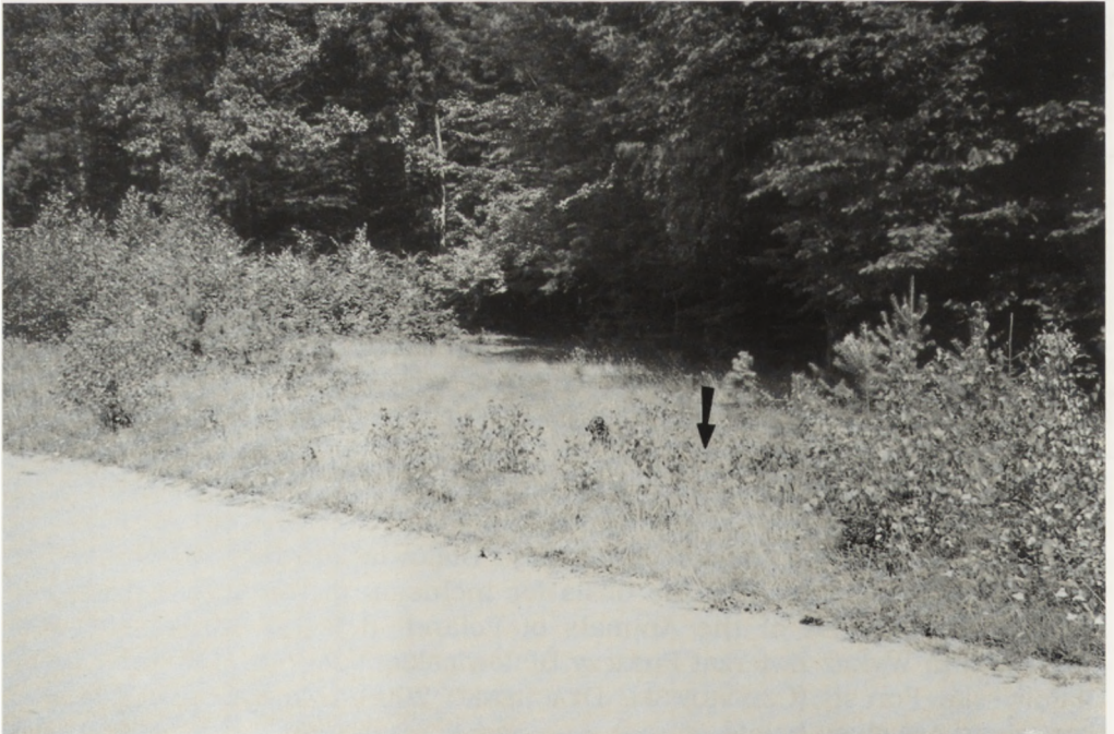
Fig. 2. Habitat of Formica glauca in Puszcza Białowieska (location of the nest is marked with an arrow).

The colony of F. glauca in Puszcza Białowieska (N-E Poland) is situated not far from the village of Topiło near Orzeszkowo (forest inspectorate Hajnówka, forest district Starzyna, forest division 632; 52°38'N, 23°31'E, UTM FD74), outside the National Park. It was discovered in 1992 and has been inspected