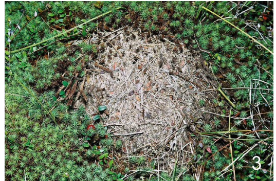
Fig. 3. F. uralensis nest in Bagno Rakowskie.