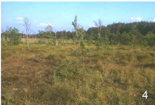
Fig. 4. Peat bog in the Moszne Lake nature reserve.