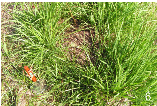
Fig. 6. F. uralensis nest in Żółwiowe Błota nature reserve (photo M. L. Borowiec).