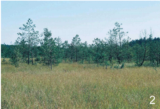
Fig. 2. Bagno Rakowskie peat bog.

the open and very wet parts of the peat bog. The Imielty Ług nature reserve, the biggest peat bog area in the region, was also explored at the same time but F. uralensis was not found there. Probably patches that at first sight seemed to be suitable for this species because of the presence of small pine trees were in fact too dry; besides Andromeda , Oxycoccus , Vaccinium and Ledum species, some Calluna vulgaris shrubs were present in the turf.