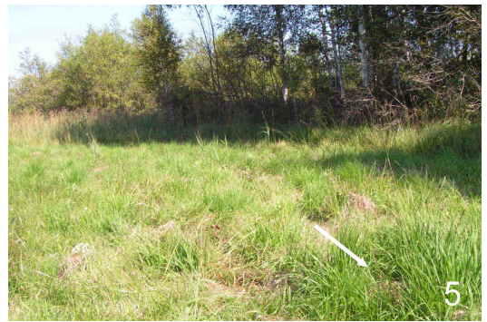
Fig. 5. Marshy meadow by the Buzornica peat bog in the Żółwiowe Błota nature reserve; situation of the F. uralensis nest is marked with an arrow.