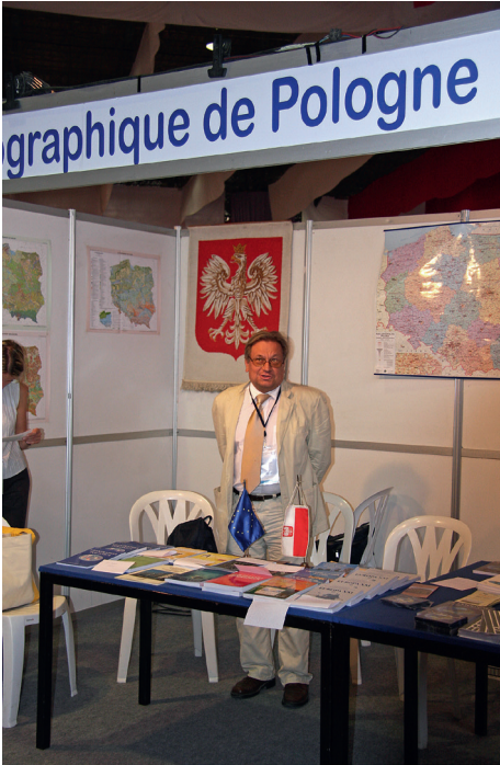
Figure 1. Professor M. Degórski manning a stand promoting Polish geography at the IGU Congress in Tunis (2008)