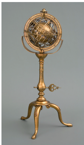
Figure 7. Jagiellonian Globe (Collection of the JU Museum)

The exhibition introduced the intellectual heritage of Polish geography to the participants in terms of its conceptual development and the equipment used for research. The objective was to make the exhibition accessible and compact enough to be attractive to wider audiences than just the conference participants. During the six months it was open to the public it achieved that target. Prof. Antonii Jackowski of the Jagiellonian University was the initiator and main organiser of the event and he deserves plaudits for his enormous efforts. The exhibition consists of two sections: one – held within the Collegium Maius building - includes research instruments, old maps, atlases and globes (including the priceless globe belonging to the JU Museum) while the other comprises plates on the history of Polish geography displayed in the Professors' Gardens of Collegium Maius (Fig. 7).