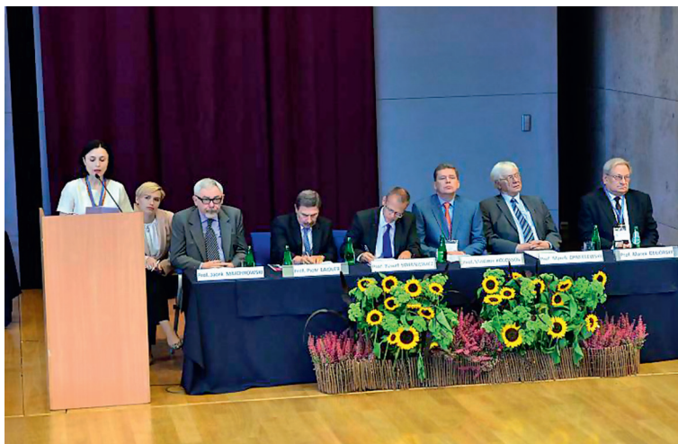
Figure 4. Opening of the IGU Regional Conference in Krakow