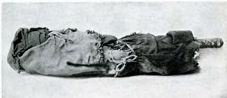
a. THE OWL SACRED PACK WITH THE OUTER WRAPPING OFF