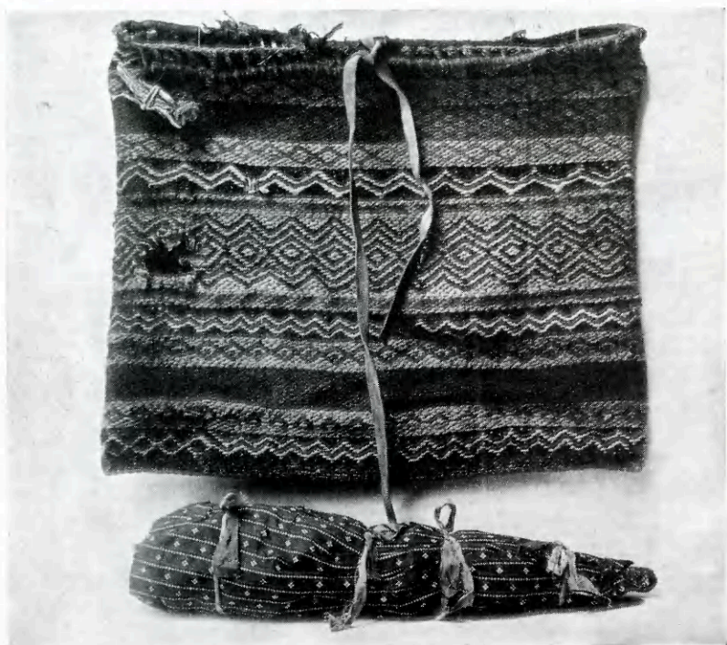
b. FIBER BAG IN WHICH THE OWL SACRED PACK WAS KEPT WRAPPINGS OF THE OWL SACRED PACK