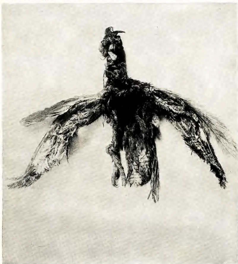
http://rcin.org.uk CONTENTS OF THE OWL SACRED PACK