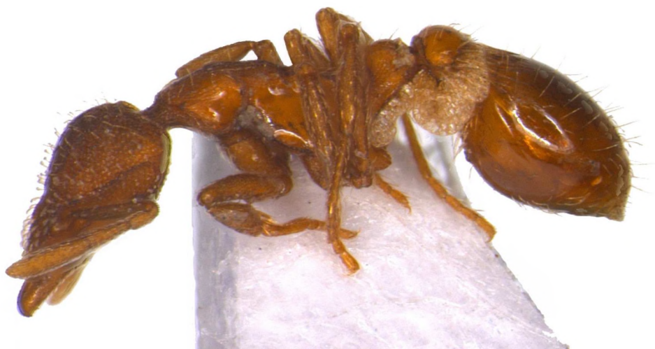
Fig. 2. Lateral view of Pyramica baudueri.

S. rogeri Emery, 1890. Among them P. baudueri is one of the most wide-spread and most common dacetine species in Europe. Its known distribution range covers continental France (Bolton 2000, Radchenko 2007), the Channel Islands (Radchenko 2007), Switzerland (Bolton 2000, Braschler 2002), continental Spain (Espadaler 1997, Bolton 2000, Radchenko 2007), the Balearic Islands (Espadaler 1997), continental Italy (Bolton 2000, Radchenko 2007), Corsica (Bolton 2000), Sardinia (Bolton 2000, Radchenko 2007), Sicily (Radchenko 2007), Malta (Radchenko 2007), Tunisia (Bolton 2000), Morocco (Bolton 2000), Greece (Agosti & Collingwood 1987, Radchenko 2007), Croatia (Bračko 2006), Macedonia F.Y.R. (Radchenko 2007), Montenegro (Petrov 2006), Hungary (Gallé et al. 1998), Turkey (Bolton 2000, Radchenko 2007), and Armenia (Arakelyan 1994).