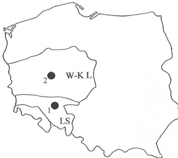
Fig. 1. Localities of C. truncatus in Poland: 1 – Wrocław (after Borowiec 2007), 2 – Rogalin ad Poznań (new locality) (W-KL – Wielkopolsko-Kujawska Lowland, LS – Lower Silesia).

The Rogalin Oak Wood (Dęby Rogalińskie or Dąbrowa Rogalińska), the biggest cluster of old oaks in Europe, stretches out on the flooded terrace of the Warta river valley, within the Rogalin Landscape Park. The wood, consisting of about 2000 oaks, mainly Quercus robur L., several hundred years old, is a remnant of old ash-elm carrs of the association Ficario-Ulmetum (=Fraxineto-Ulmetum), in which Q. robur is a constant component of the tree stand