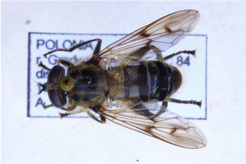
Fig. 2. Male of Chalcosyrphus eunotus.

Ch. eunotus (Fig. 2) is listed as a saproxylic indicator and stenotopic species, closely associated with natural, unregulated stream channels. The larvae live in decaying wood deposited in water. Imagines have been found along the edges of streams flowing through the deciduous forest ( Quercus-Fraxinus-Ulmus ) resting on partially submerged logs (Renema 2001). Ch. eunotus is known from a few localities in the Netherlands, France, Germany, Serbia and also from one or two records in Belgium, Spain, Switzerland, Croatia, Republic of Macedonia, Romania and Slovakia. It has lately been found in the Czech Republic (Mazanek et al. 1999) and Turkey (Saribiyik 2009).