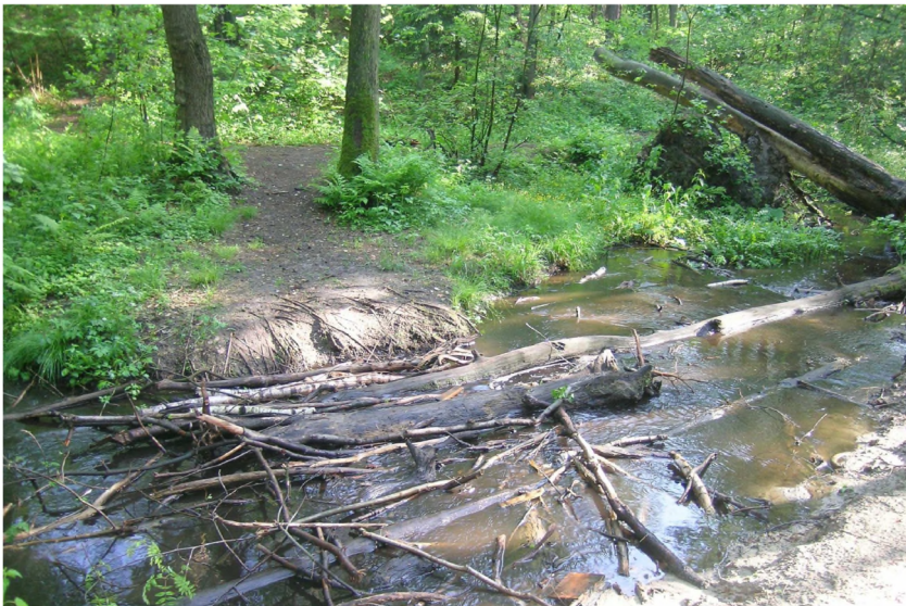
Fig. 3. Habitat of Chalcosyrphus eunotus on the Linda stream.

Ch. eunotus (Fig. 2) is listed as a saproxylic indicator and stenotopic species, closely associated with natural, unregulated stream channels. The larvae live in decaying wood deposited in water. Imagines have been found along the edges of streams flowing through the deciduous forest ( Quercus-Fraxinus-Ulmus ) resting on partially submerged logs (Renema 2001). Ch. eunotus is known from a few localities in the Netherlands, France, Germany, Serbia and also from one or two records in Belgium, Spain, Switzerland, Croatia, Republic of Macedonia, Romania and Slovakia. It has lately been found in the Czech Republic (Mazanek et al. 1999) and Turkey (Saribiyik 2009).