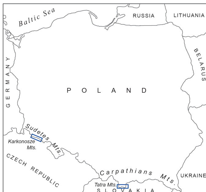
Figure 1. Location of the study areas.

50 km long and almost 20 km wide (Fig. 1). The Tatra landscape is of an alpine type (Klimaszewski 1988), the last small glaciers at high elevations melting in Venediger (8.3 ka BP) (Baumgart-Kotarba & Kotarba 2001). Nowadays, the glacial corries are filled with multiannual patches of firn and ice, as well as with inactive, fossil rock glaciers. There is also permafrost in the Tatra Mts., mainly in talus cones, ice caves and numerous debris flows which occur on rockfall-scrée slopes. The study area includes the Polish part of the High Tatras and the Western Tatras (from the Rybi Potok Valley to Kopa Kondracka), built up mainly of crystalline rocks (granites, gneisses). The substrates chosen for examination were all man-made (monuments, roads, huts, split boulders) and were located in the altitude range from 1500 to 2134 m a.s.l. on the mountain ridges (including passes), slopes and valley bottoms (Tab. 1). Mean annual air temperature in this area ranges from 2.5 to -1.5°C, and mean annual precipitation oscillates between 1000 and 1450 mm (Hess 1965, 1996).