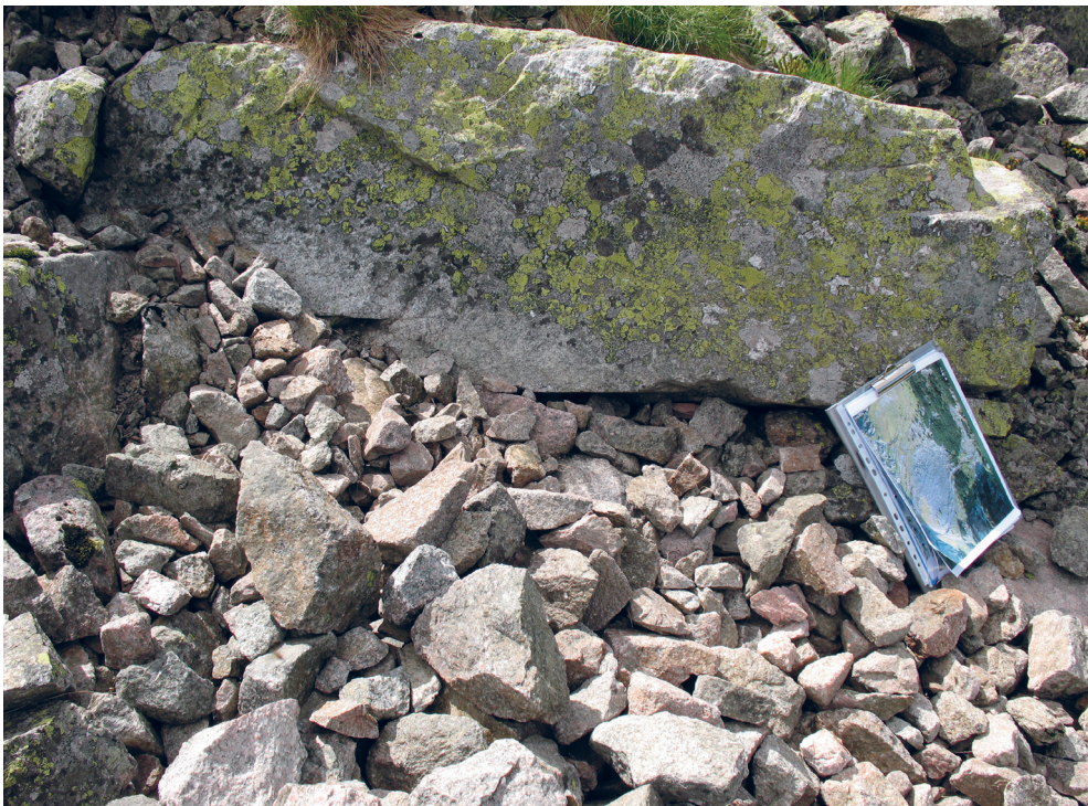
Figure 4. A boulder with an uncovered, thallus-free lower section.

A small part of a talus cone of debris-rockfall origin, which is located in the Tatra Mts., is presented in Figure 4. There is a visible lack of thalli on the debris surrounding a boulder. However, the boulder itself is overgrown by thalli from all sides. The same applies to another boulder which is partly visible in its vicinity. Such a situation can easily be explained by the constant and intense fresh supply of debris from the rock wall. The fresh surfaces of debris are covered by new debris before they can become colonized by lichen. However, detailed investigation of the boulder's surface suggests a different conclusion. The lower part of the boulder is entirely devoid of thalli. There are no signs of movement or rotation, neither of the boulder nor of the other boulders nearby. This