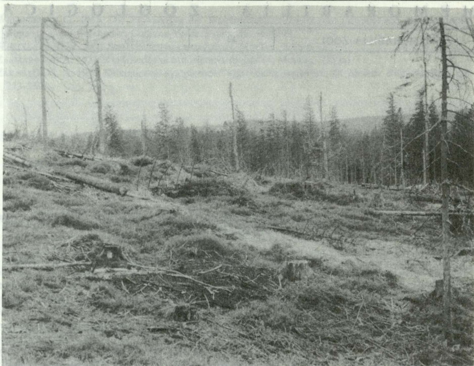
Fig. 1. The post-outbreak clearing of the spruce forest on the Kudłoń Mt. (1987).

The zone of the piedmont deciduous forests ( Quercus-Carpinetum ) reaches up to 600 m above sea level. It has a mosaic character nowadays. In river valleys and on more gentle slopes forests have been cut out and the areas thus obtained turned into cultivation or into meadows and pastures. Places unsuitable for agricultural use (steep slopes, rocky areas, banks of streams, and sides of roads) still retain patches of woods or belts with tree stands.