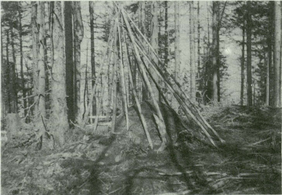
Fig. 4. The collective "artificial" Nest P-I of F. polycetena on the Jaworzyna Kamienicka Mt. (1988).