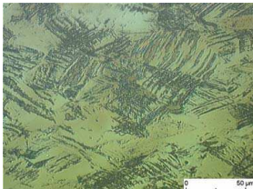
Fig.1. The lathlike martensite – AISI 304 steel [3]