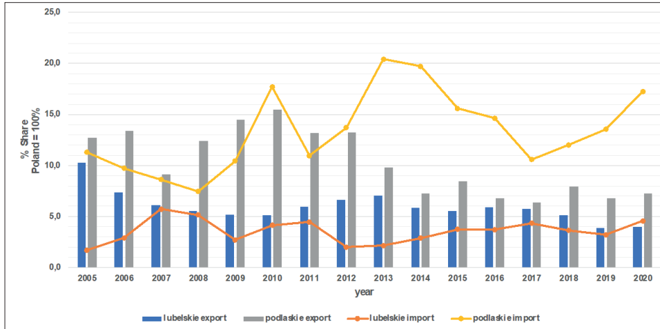
Chart 2. Share of Podlaskie and Lubelskie Voivodeships in total Polish-Belarusian exports and import between 2005 and 2020 (in %)