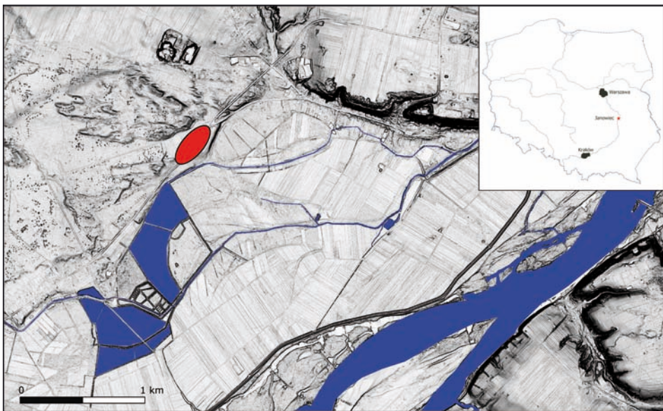
Fig. 1. Position of Site 3 in Janowiec, Puławy district with the application of a digital terrain model (DTM)

Site 3 was discovered in 1981 during a field survey conducted within the framework of the Polish Archaeological Record (Bargiel and Zakościelna 1995, 318). Successive field sur-