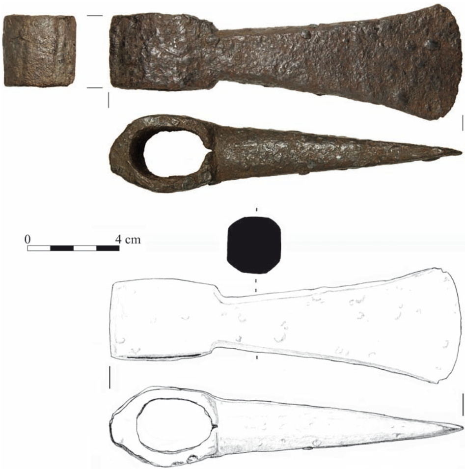
Fig. 2. Axe-head from Janowiec, Puławy district

wards, thanks to which they were wedged in the eye of the butt with their upper wider part. To increase this effect sometimes the upper part of the haft was dome-shaped rather than tapering and sometimes nails or rivets were used as wedges. No traces of the use, known from the Middle Ages, of leather straps to fasten the haft to the head (Kontny 2018, 80, 81, fig. 12, with further literature) have been found. As no remains of wood have been traced, it is not possible to determine which species were used to make the haft. On the basis of the 64 finds from northern Europe (Vimose, Nydam, Illerup, Kragehul) it may be assumed that hard wood was used, mainly of ash and fruit trees ( pomaceae ) less frequently hazel or oak wood, and very rarely beech, maple and holly; the same materials were used to make hafts of socketed axes (Malmros 2020, 97, 118, fig. 3: 26, table 3: 6, 18). One should mention