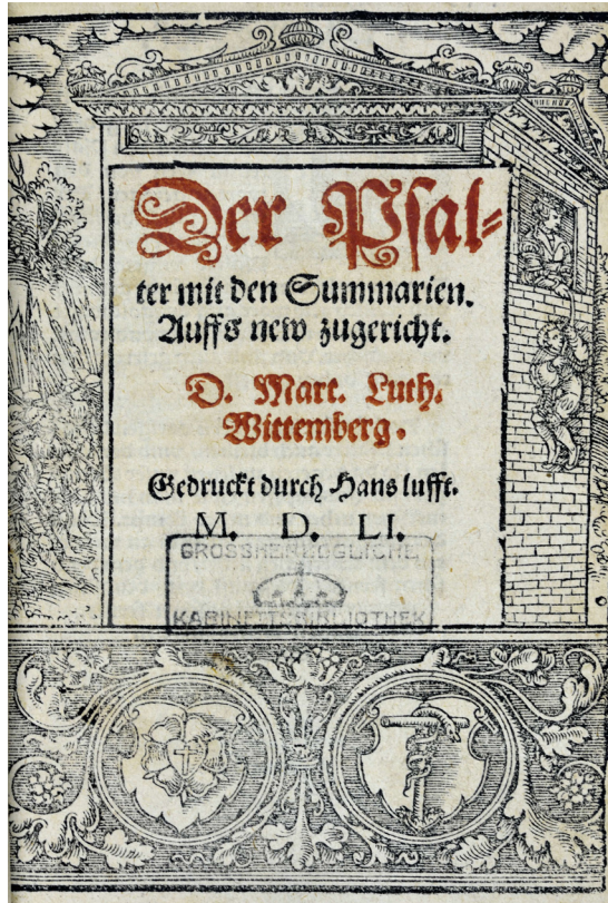
Fig. 1. Title page of M. Luther, Der Psalter mit den Summarien. Auff's new zugericht... (Wittemberg, 1551), BUW, ref. Sd.608.1959

The emblems of individual reformers were also stamped on other title pages of sixteenth-century prints, a sort of authorization that confirmed that the printed work belonged to the Reformation writings. 21 The illustration was designed, especially for the first complete edition of Martin Luther's 1531 psalms, by an artist whose name is