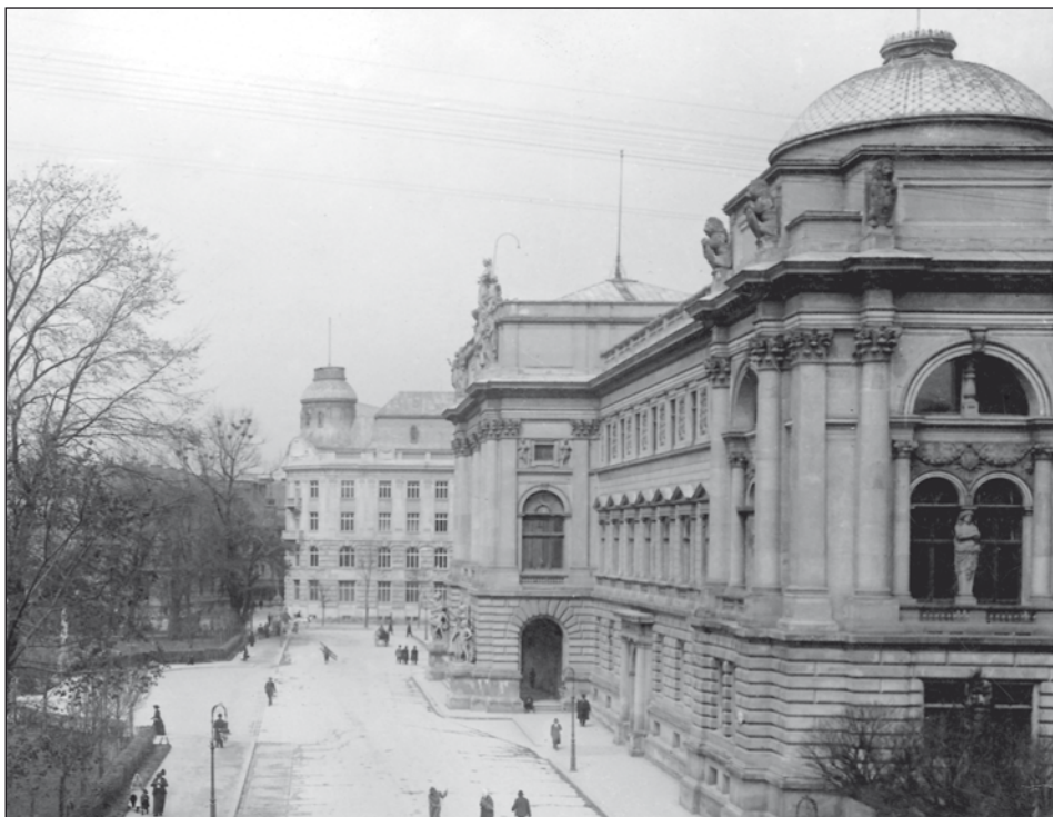
Fig. 2. Building of Lviv University during the interwar period