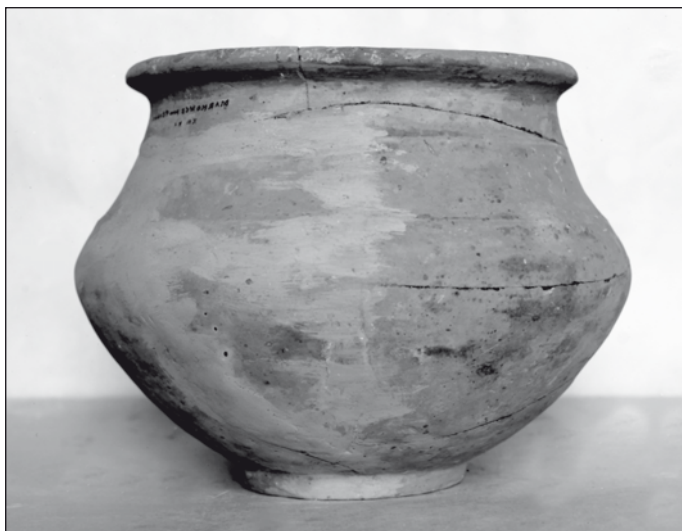
Fig. 9. Clay pot from excavations conducted by K. Żurowski in Markivtsi. 1938. Archive of DA IUS NASU