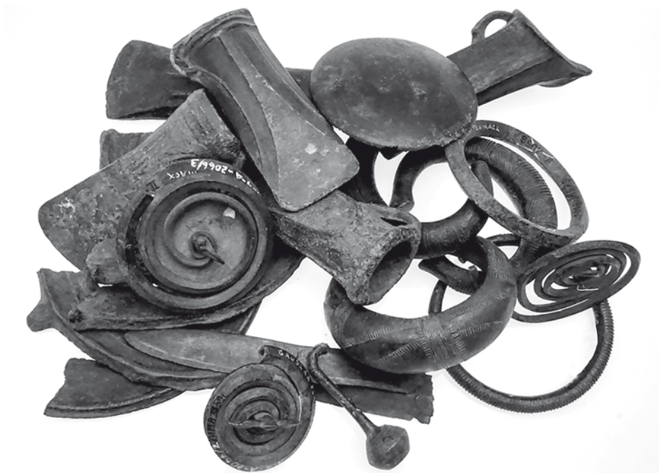
Fig. 3. Hoard of bronze items from Grushka. Lviv Historical Museum