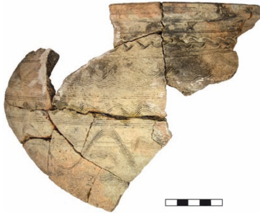
Fig. 2. Szczaworyż Busko County, Świętokrzyskie Voivodeship. The diversified colour of vessels surfaces

great strongholds of the tribal period or the practice of building huge barrow-graves, the specific recipe for this type of ceramic fabric for vessels, remains one of the distinguishing features of the material culture of early medieval western Lesser Poland (Radwański and Tyniec 2010). Use of clays with admixture of calcium carbonate resulted mainly from accessibility of raw material deposits. Despite the fact that this raw material caused numerous technological problems (for example this fabric required taking extra care during firing clay pots), such type of pottery in a short time became dominant (at sites in the area of contemporary Kraków) or constituted a very significant percentage share among pottery production of pre-craft character (for example in Kraków Nowa Huta-Mogiła, Kraków Kurdwanów or in hillforts in Stradów or Szczaworyż).