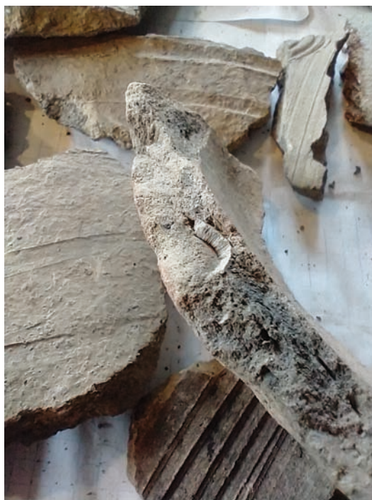
Fig. 4. Proszowice, Proszowice County, Lesser Poland Voivodeship. Pottery with admixture of crushed Inoceramus shells

It is still an open question whether the admixture of crushed Inoceramus shells is the potential source of calcium carbonate in “white” pottery as it was suggested in a footnote ( op. cit. , footnote 12). The lack of published information on observations of such remains in assemblages of “white” pottery deriving from other regions and their presence in the ceramic fabric at two sites from the Nida Basin (Stradów and Szczaworyż) may testify the local character of this phenomenon. It turns out that crushed Inoceramus shells in ceramic fabric are also present in pottery from Kraków (for example inventory reports on