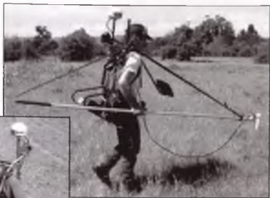
Caesium magnetometer integrated with GPS for efficient data collection.

For archeology, UXO surveys, hazardous waste, utility locating, and void detection, there's no better combination than the MagMapper™ system. Great plotting and modeling software and valuable case histories are available free on our website.