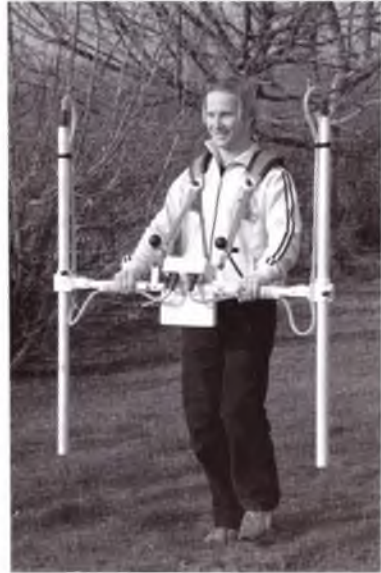
Grad601-2 dual gradiometer