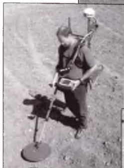
MetalMapper™, the first metal detector to work in magnetic soil.