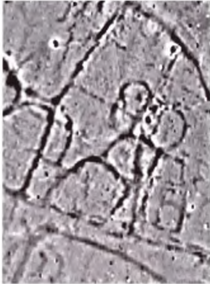
Roman/British site 90m x 120m scaled to +/-3nT