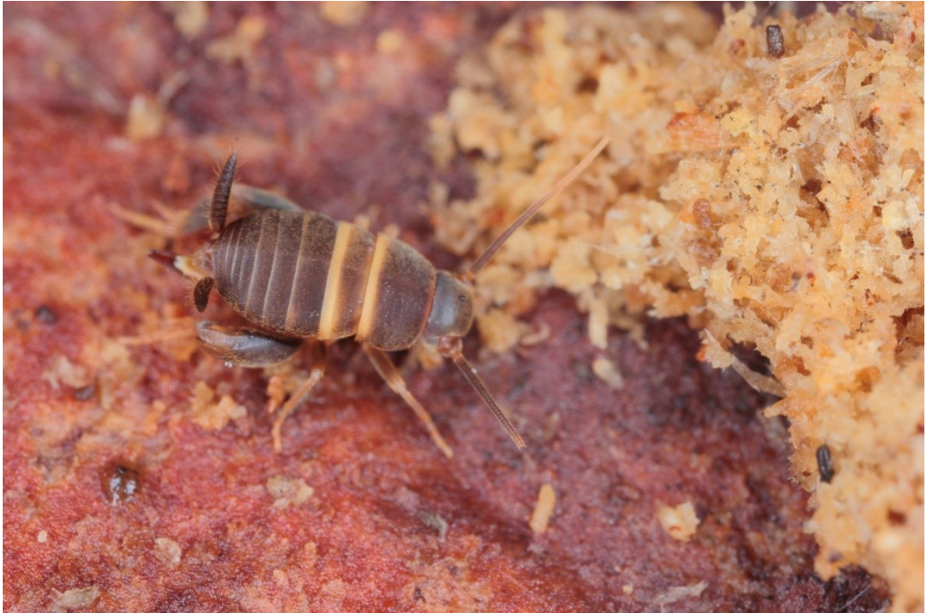
Fig. 3. Myrmecophilus acervorum , female, Czmoń, Wielkopolska-Kujawy Lowland, Nov 2019.

In the years 1851 to 2022, M. acervorum was recorded in Poland at 143 sites. Until 2010 the records were sparse (35 sites), whereas in the period 2011–2022 the species was recorded at 108 sites. Most of the records come from Wielkopolska-Kujawy Lowland (37) and Mazovian Lowland (31), since M. acervorum has been actively searched for in these regions (Table 1, Fig. 4).