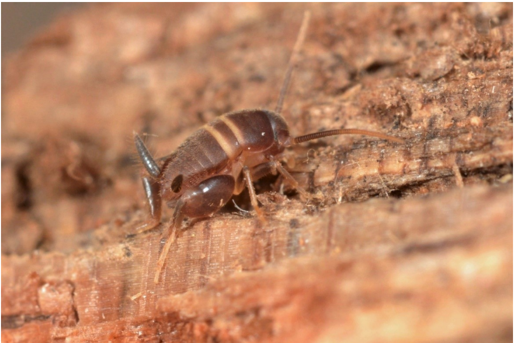
Fig. 2. Myrmecophilus acervorum , female nymph, Huta Garwolińska, Mazovian Lowland, Apr 2022 (Photo by J. Błędowski).