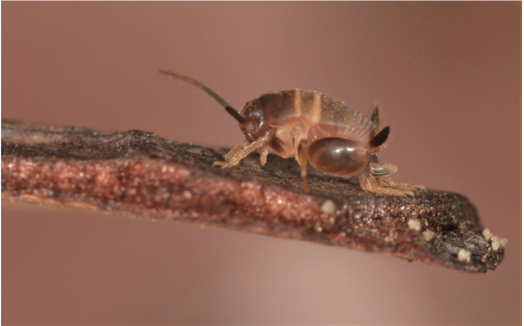
Fig. 1. Myrmecophilus acervorum , female nymph, Cyganówka, Mazovian Lowland, Aug 2020 (Photo by J. Błędowski).