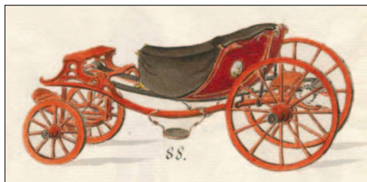
Fig. 4. Chaise, drawing from Johann Christoph Brotze Collection

personally used by Meyer. In the 18th century, the chaise , a light, two- or four-wheeled vehicle with a French name, became very popular. 79 (Fig. 4).