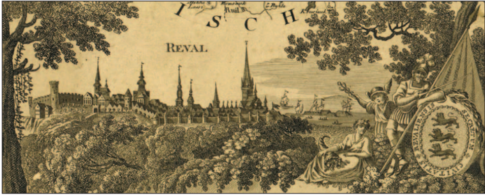
Fig. 2. View of Tallinn in 1796. Detail from Count Ludwig August Mellin's map "Der Revalsche Kreis"

Ryc. 2. Widok Rewala (Talinna) w 1796 r. Szczegół z mapy hr. Ludwiga Augusta Mellina „Der Revalsche Kreis”