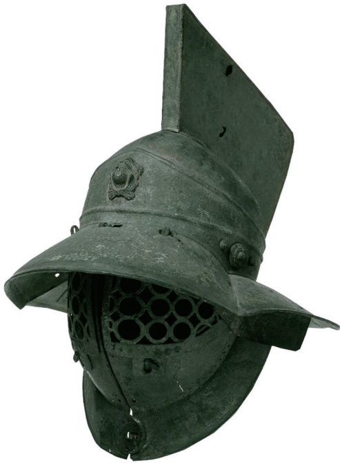
Fig. 5. Gladiator helmet from Museo dei Gladiatori, 50-75 AD. After La Regina 2001, 373.