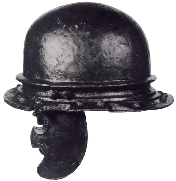
Fig. 6. Western-Celtic helmet (Agen helmet) found in Giubiasco, 1 st century BC. After Schaaff 1988, Fig. 16.

Thielle in Switzerland). 88 It was forged from one sheet of steel and has a deep, dome-shaped skull transforming into a brim of an irregular width. In its front part, it is two times narrower than in its back part, reinforced by a fold or the so-called ‘step’. Additionally, it has cheek pieces tied under the chin with leather straps and its characteristic feature is a narrow triangular bulge above the brim running around the entire skull. 89 Furthermore, the find from Agen has a plume spire topping the skull. Most experts on ancient weapons allocate to the Agen type two finds from the forests of Rouvray and Louviers in Normandy. 90 These differ from the four other finds primarily because of their conical skulls topped with a plume and brims of the Boeotian shape. Probably this form is a combination of the late-Roman Boeotian helmet used in the Roman army in that period with a newly encountered Celtic form. All these finds are rather precisely dated to the mid- 1 st century BC.