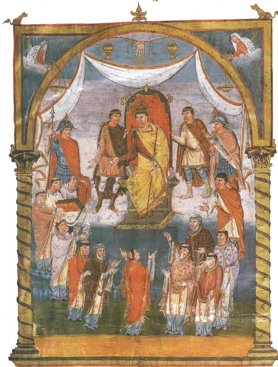
Fig. 7. Miniature from The First Bible of Charles the Bald , c. 846. After Skubiszewski 2001, 251.

( hasta ), and cloaks ( paludamentum ). The same equipment (without armour) also appears in The Gospels of Lothair and the helmet alone in The Golden Psalter of St. Gall . Its design was probably the idea of the illuminators, especially since its form seems to be rather impractical and even quite fantastical.