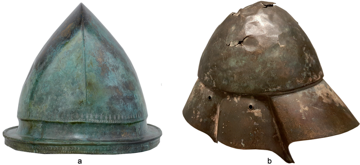
Fig. 2. Helmets: a – Negau helmet sold in Hermann Historica in 2005. After Hermann Historica. 49. Auktion, lot. 182; b – Boeotian helmet from Ashmolean Museum.

gained so much popularity over time that ultimately it became the symbol of Hermes, god of roads and travellers. 15 It was also keenly worn by horsemen, so in the 5 th century BC its bronze version appeared, designed specifically for cavalry. This helmet had a shape that was very similar to that of the original petasos , i.e., a dome-shaped skull and a wide brim with a single fold on each side. The edge of the brim was punched, so the helmet could be covered with felt to protect it from overheating. An original example of such a helmet was found in 1971 in one of the tombs in Athens and is currently kept in the National Archaeological Museum in Athens. 16 Furthermore, such headdresses often appear in paintings and on coins depicting warriors on horses from the 5 th and 4 th centuries BC, mostly from regions of Thessaly, Boeotia, and Athens. 17