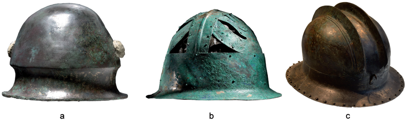
Fig. 1. Helmets: a – bossed helmet with a brim sold by Hermann Historica auctioneers in 2009. Courtesy of Hermann Historica; b – composite helmet sold by Hermann Historica in 2010. Courtesy of Hermann Historica; c – double-crested helmet found in Klenik near Vače, Slovenia. After Božič 2014, Abb. 1.