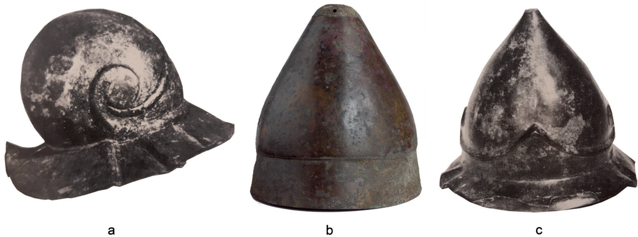
Fig. 4. a – late-Boeotian helmet from the Museum of Art and Design Hamburg. After Waurick 1988, Fig. 24; b – Pilos helmet sold in Hermann Historica in 2005. After Hermann Historica. 49. Auktion, lot. 163; c – Attic-Boeotian helmet ( konos ) from the Ashmolean Museum in Oxford. After Waurick 1988, Fig. 14.

ans. Most finds come from Thrace (at least four) and the northern Black Sea coast (about ten). Iconographic sources come from Macedonia, Samos, and Asia Minor. It is assumed that this helmet probably originated, just like the pilos helmet, in the territory of the Balkans. 76