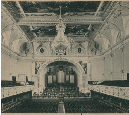
Dla Ciebie Polsko (25.09-17.10.1920)