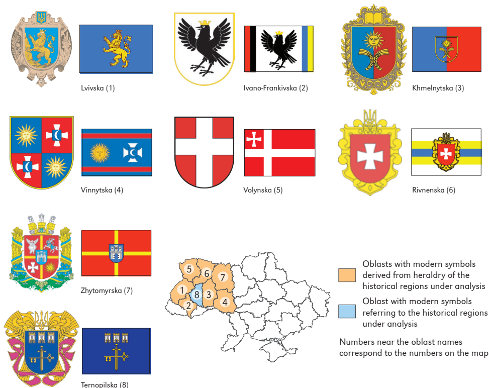
Figure 3. Use of heraldic symbols of historical regions in the emblems and flags of administrative oblasts