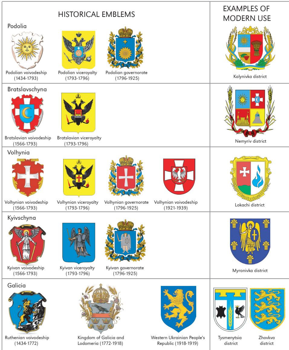
Figure 1. Examples of heraldic symbols of historical regions and their use in modern territorial emblems