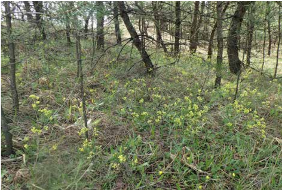
Fig. 1. Buckler mustard in coppices on abandoned mine land in the Olkusz region, 2019