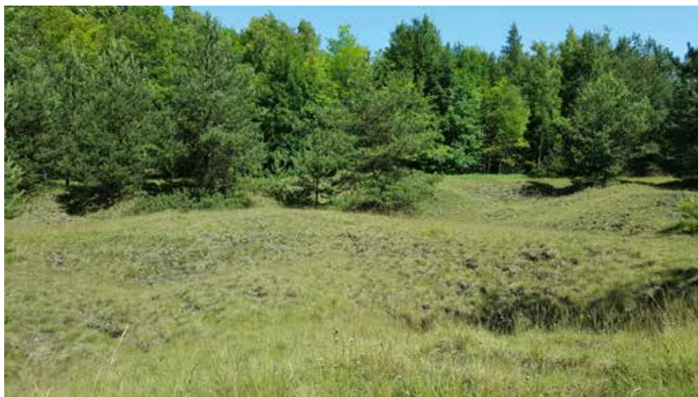
Fig. 5. Western fragment of the 'Armeria' Natura 2000 site, 2018