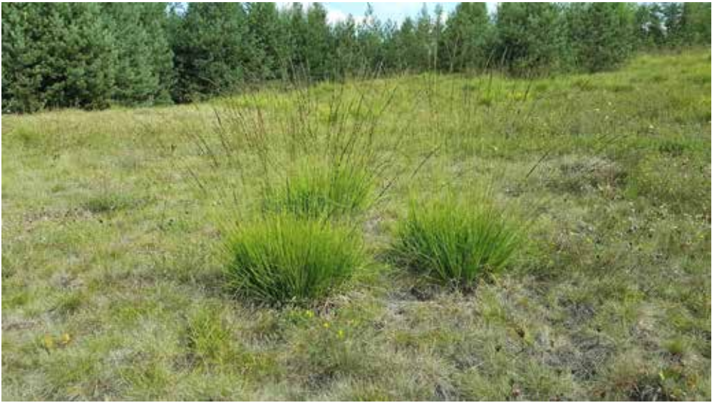
Fig. 2. Purple moor-grass in calaminarian grassland in the 'Armeria' Natura 2000 site, 2019