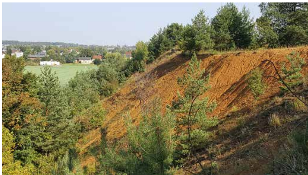
Fig. 6. Western slope of the 'Fryderyk' mine heap in Tarnowskie Góry, 2017

Sites of calamarian grasslands, situated in Jaworzno, have not yet been given legal protection within the Natura 2000 network. Zinc and lead ores were extracted in this area from the Medieval times to the beginning of the 20th century (Molenda 1972, Sas-Gustkiewicz et al.