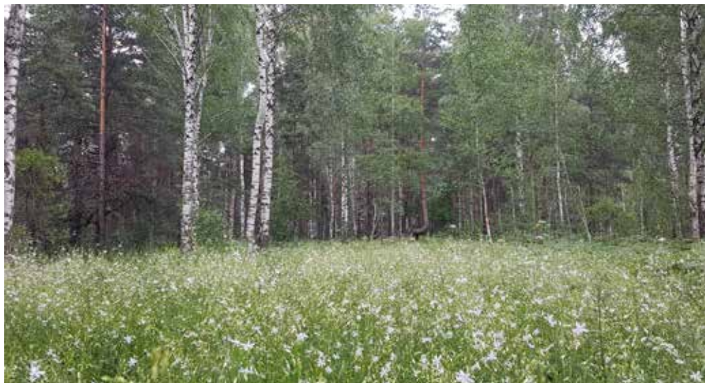
Fig. 9. Fragment of the flat-topped Sadowa Góra Hill in Jaworzno, 2018

and lichens. On open bare soil, xerothermic and light-loving species may come back, while patches of bare mineral substrate may be colonized by metallophytes (particularly those showing preference for a high concentration of heavy metals, e.g. buckler mustard; Bemowska-Kałabun et al. – Chapter 6 of this volume). Disturbance of the continuity of the plant cover should also increase the frequency of natural disturbances, e.g. landslides, exposing fresh bare metalliferous substrates. There are also plans to rake and remove the thick layer of dead plant remains to decrease soil fertility, and consequently, to limit the intrusion of woody species, expansive grasses, weeds, and invasive species. Their appearance is often associated with an increase in the amount of nutrients in the soil; the source of these elements is decomposing organic matter (Pärtel and Helm 2007). Dead leaves piled up around high grasses will be removed as well. The open spaces may constitute supplementary microhabitats, which are suitable for metallophytes that are generally poorly competitive (Baker