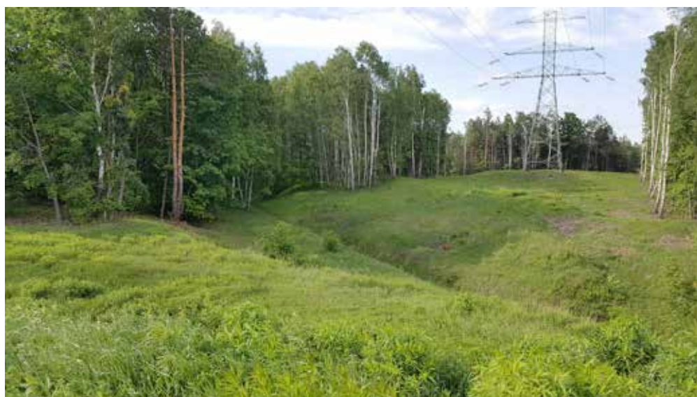
Fig. 7. Fragment of the operational area of the 'Fryderyk' mine in Długoszyn, 2018 Ryc. 7. Fragment obszaru działalności kopalni „Fryderyk” w Długoszynie, rok 2018

2001). At first, the prospecting and mining of ores was carried out by shallow digging. Over time, better tools and machinery were used and ores were extracted from deeper and deeper deposits. As a result, the area was covered by an irregular network of gallery workings and tens of small shafts, 2.20 m deep (Molenda 1972). To the present day, in the Długoszyn city district of Jaworzno, in Ciężkowice, and in the surroundings of the Sadowa Góra Hill, one may spot the signs of past ore mining and processing activity, such as piles of earth, pits, hollows, sinks and spoil heaps. Soils of these areas have high levels of heavy metals, considerably exceeding concentrations of these metals in the soils of neighboring areas (Pasiczna 2011).