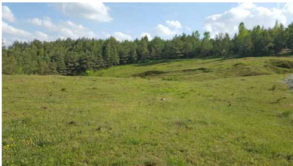
Fig. 3. Southern fragment of the 'Pleszczotka' Natura 2000 site, 2018 (photo M. Jędrzejczyk-Korycińska) Ryc. 3. Południowy fragment obszaru Natura 2000 „Pleszczotka”, rok 2018 (fot. M. Jędrzejczyk-Korycińska)

sizes, formed as a result of the uneven subsidence of waste material. Soils are mostly dry, skeletal, and shallow with a small content of nutrients and a high content of trace metals (up to 39,000 mg/kg of zinc, 2,600 mg/kg of lead and 180 mg/kg of cadmium; Szarek-Łukaszewska and Grodzińska 2011, Kapusta et al. 2015, Jędrzejczyk-Korycińska et al. 2015).