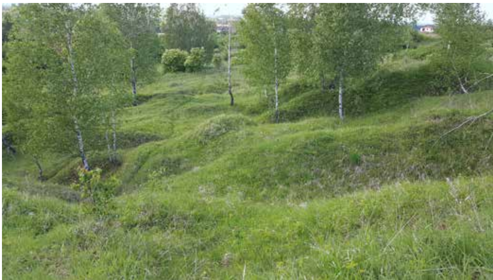
Fig. 8. Western fragment of Góra Wielkanoc Hill, 2018