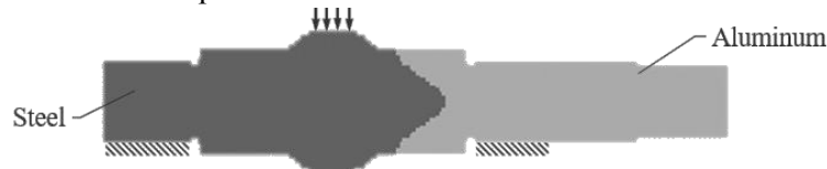
Figure 3: Optimized result for the hybrid shaft under bending with IZEO and manufacturing constraints.

For the optimization process, the objective is to have a light component, meaning the most use of aluminium and a restricted safety factor. Since this shaft has a fixed geometry, this geometry is here our design domain and the initial point of the evolution for the aluminium is the extreme side where the aluminium is intended to be in the serial manufacture. The result of the optimization process is presented in Figure 3, where the load conditions of the simulation is also represented.