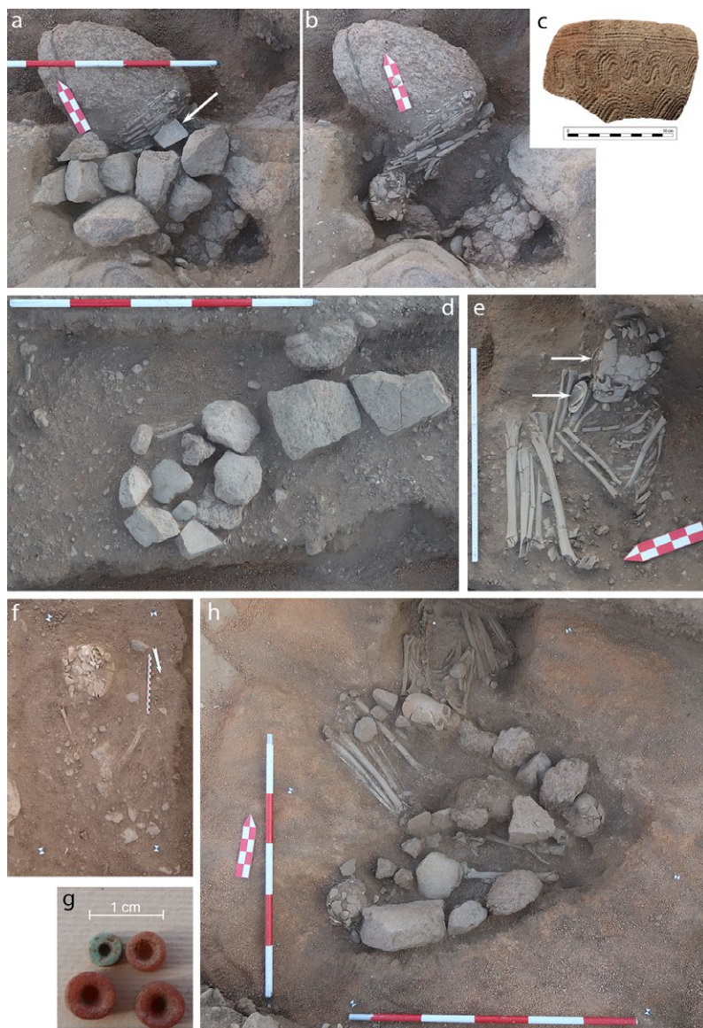
Fig. 4. Varied types of burials and grave constructions uncovered in Trenches 21 and 22: a – stone pile over B.5, the arrow points to the fragment of a vessel shown in Fig. 4c; b – B.5 in a tightly contracted position achieved most likely through some kind of bandage; c – fragment of a globular vessel with a rim and Dotted Wavy Line decoration; d – a circular arrangement of granite cobbles, lithic artefacts and fragments of lower grinders above the upper part of B.8 (left) and larger stones covering B.1 (top right); e – B.6 with two shells of Nile bivalve (marked with arrows); f – burial of a child B.19; g – examples of stone beads found with B.19; h – burials B.22 (top), B.27 (centre) and B.26 (bottom) during exploration.