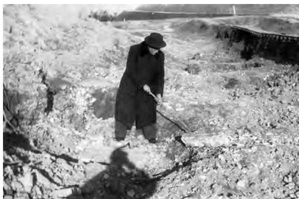
Fig. 6. The excavation at Sowiniec (Cracow). Information overleaf: 'Jura excavates the area himself and looks for artefacts, winter 1936'.