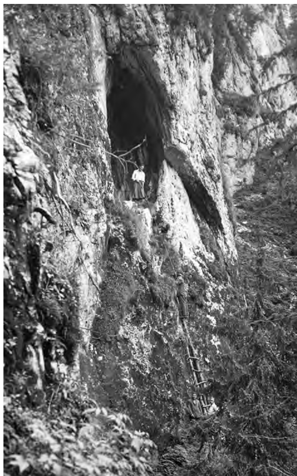
Fig. 11. Pod Kopą Magury Cave, Tatra Mountains, excavation in 1936 or 1937: the entrance to the cave and the excavators climbing the rocky slope to get to the excavation unit.