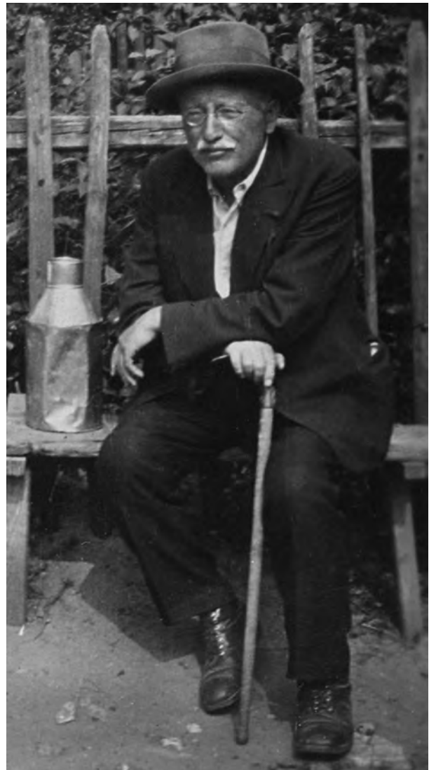
Fig. 1. Albin Jura during the excavation at Dąbrowa Szlachecka, Cracow dist. in 1939. Information overleaf: 'in front of Socha's house'.

Albin Jura, born in Wieprz in the Wadowice district in 1883 (Wosiński 1969: 66; Fig. 1), graduated from the Faculty of Philosophy of the Jagiellonian University and soon became involved in socio-political activity. In 1910, he published a book on the prehistory of Poland, followed a year later by a paper that popularised the history of the Polish land, both texts issued under the imprint of the Przyjaciel Ludu , an illustrated weekly and socio-political organ of the Polish Peasant Party. After linking up with the Alliance of Democrats in 1918, Jura co-operated with that party in editing their Dziennik Polski daily and Tygodnik Polski weekly during the Second World War. In the post-war period, he was a deputy-chairman of the Regional Committee, a member of the Supreme Council and a member of the Central Committee of that political organisation. 1 Between 1919–1928 he also belonged to the Polish Peasant Party 'Piast' and from 1935 he was a deputy-chairman of the Agricultural Society in Lesser Poland. He believed that every professional activity should be based on appropriate education. Accordingly, at a session of the Legislative Sejm in 1947, when he acted as a member of the State National Council and a secretary of the Agricultural Commission, he put forward a motion to form 3000 agricultural schools in Polish communes (Wosiński 1965: 365).