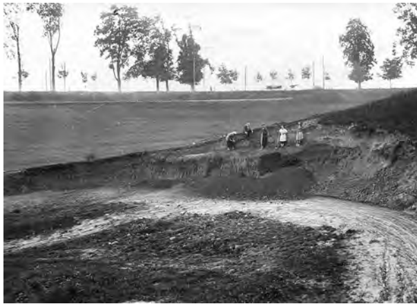
Fig. 8. The excavation at Zwierzyniec (Cracow) in 1937. Information overleaf: 'Zwierzyniec, 17/9, removal of the 2nd metre, 09.1937, photo by O. Tomasz'. Photo from the Archive of the Department of the Palaeolithic and the Mesolithic, the Archaeological Museum of Cracow.