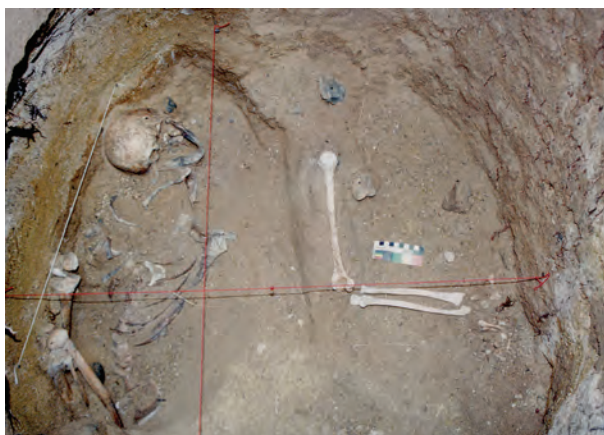
Fig. 3. The upper skeleton in Trench VI-9-1, Shaft 4 (LGK).