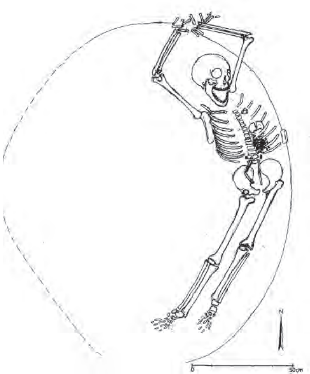
Fig. 4. The lower two skeletons, those of a woman and an infant, in Trench VI-9-1, Shaft 4 (LGK). Drawn: T. Janků.

cranium and mandible of the dog that lay at the same level in the western extension somewhat more to the south. Two small slender bones, evidently from the hind limb of a green frog, were found over the clasped hands of the female body. Near the skeleton lay three precores (one of them weighed 1.6kg), three flakes, and a hammerstone. Removal of the fill of the undercutting was stopped about 20cm below the lower skeleton, and we removed sand from the center of the shaft only.