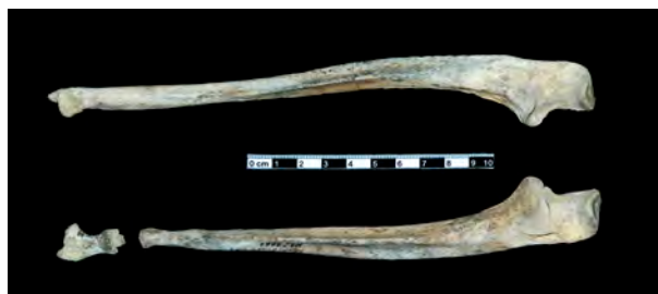
Fig. 6. The lower female skeleton, ulnae with distinct muscle attachments. Left ulna with unhealed fracture.

of the sulcus preauricularis on both hip bones. Enamel hypoplasia on the incisors and Harris lines on the tibiae (Dočkalová and Čižmář 2008: 56 and Fig. 49; Tvrđý 2010: 406, 408) show evidence of stress experienced by both individuals during their growth and development. The health condition of the lower woman was poorer than that of the upper one. She suffered from iron deficiency, evident from the porotic hyperostosis on the occipital part of cranium, and her left ulna had been broken and healed with pseudoarthrosis (Tvrđý 2010: 406). Both skeletons show evidence of hard physical activity, i.e. distinct muscle topography (Fig. 6), Schmorl's nodes on lumbar vertebrae, and osteophytes (Tvrđý 2010). Such phenomena were not uncommon in the then population (Dočkalová and Čižmář 2008: 72–74), however their common occurrence on one skeleton is quite exceptional.