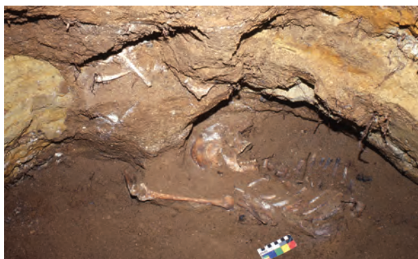
Fig. 5. The upper thorax of the lower skeleton, a woman with a newborn child on her breast. Above the cranium is a partial dog skeleton.

cranium and mandible of the dog that lay at the same level in the western extension somewhat more to the south. Two small slender bones, evidently from the hind limb of a green frog, were found over the clasped hands of the female body. Near the skeleton lay three precores (one of them weighed 1.6kg), three flakes, and a hammerstone. Removal of the fill of the undercutting was stopped about 20cm below the lower skeleton, and we removed sand from the center of the shaft only.