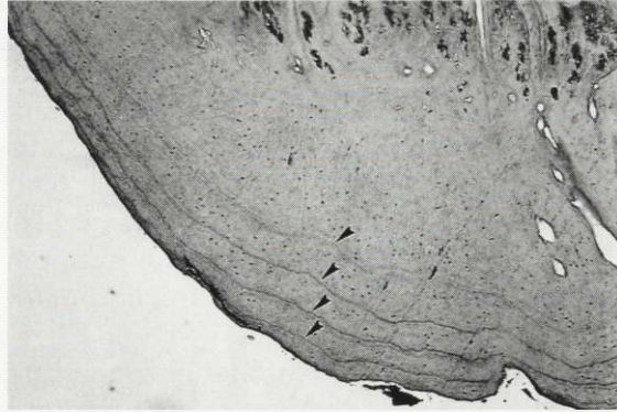
Fig. 2. An individual 5 years 6 months old showing 4 continuous, double lines (40× magnification). Observed at 100×, it shows 1 more line under formation.