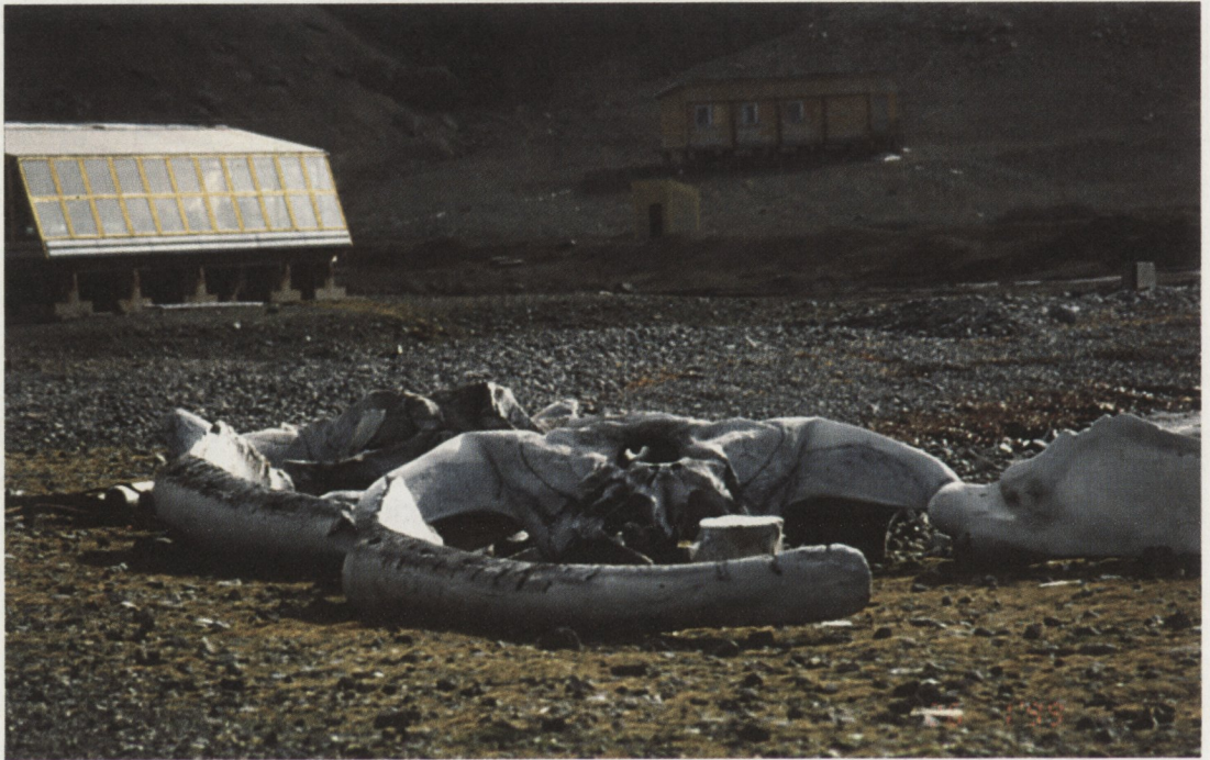
Photo 1. The whale bones make an important component of the Admiralty Bay area landscape

many bones, mainly vertebrae and ribs, were either destroyed or taken away, while the skulls remained in place.