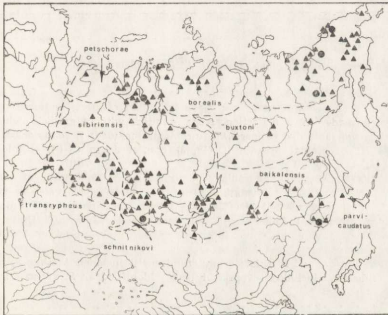
Fig. 2. Distribution of Sorex tundrensis subspecies in Eurasia. Circles indicate collection localities of specimens measured for this study; triangles indicate collection localities of Stroganov (1957), Dolgov (1967), Fedyk & Ivanitskaya (1972), Yudin et al. (1976), and Sokolov & Orlov (1980).

and listed several characters in which they differed. Rausch (1953) disagreed, considering the differences between the two taxa insufficient to warrant full specific status, although he did not formally place them in synonymy. He also pointed out that arcticus and tundrensis were closely related to araneus . Bee & Hall (1956) studied Alaskan populations and formally referred tundrensis to arcticus . The shrews included in araneus in the U.S.S.R. were studied by Stroganov (1957), who separated several taxa and referred them to arcticus . As a result of these revisions, four subspecies of arcticus ( arcticus , laricorum , maritimensis , tundrensis ) were recognised in North America, and seven in the U.S.S.R. ( baikalensis , borealis , buxtoni , petschorae , schnitnikovi , sibiriensis , transrypheus ). A eighth Palearctic subspecies, parvicaudatus , was described subsequently (Okhotina, 1976).