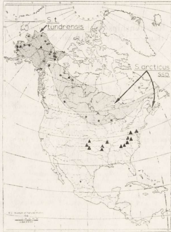
Fig. 1. Distribution of Sorex arcticus and Sorex tundrensis in North America. Circles indicate collection localities of specimens used in this study; triangles, localities of fossils identified as S. arcticus .

subgenus Sorex , and posses a well- developed post-mandibular foramen but lack the pigmented ridge on the lingual face of the unicuspid (Junge & Hoffmann, 1981). The third unicuspid is larger than the fourth and there is no accessory tine on the medial face of the first upper incisor. The glans penis of each is long and cylindrical, tapering to a point, with no elaboration of the tip. Cytologically, Sorex araneus and Sorex arcticus are characterized by the presence of trivalent sex chromosomes (X, Y1, Y2) in the male (Meylan & Hausser, 1973). Since the most obvious differences between these species is size, the systematic relationships between the common shrew of Eurasia and the Palearctic " S. arcticus ", on the one hand, and between the Nearctic arctic and tundra shrews, on the other, have been in some dispute.