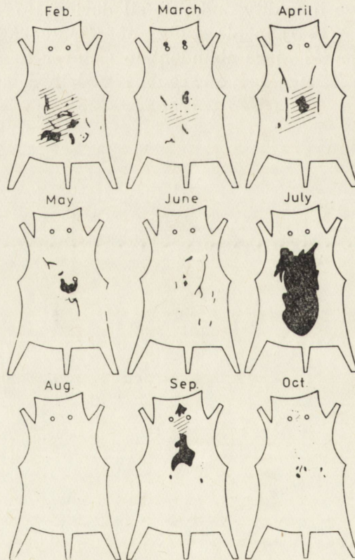
Fig. 2. Moulting in Allactaga euphratica . Typical picture of the inner side of the skin in different months.

Fig. 3 shows the moulting in Jaculus jaculus . No moulting was observed during all the months except in September and October.